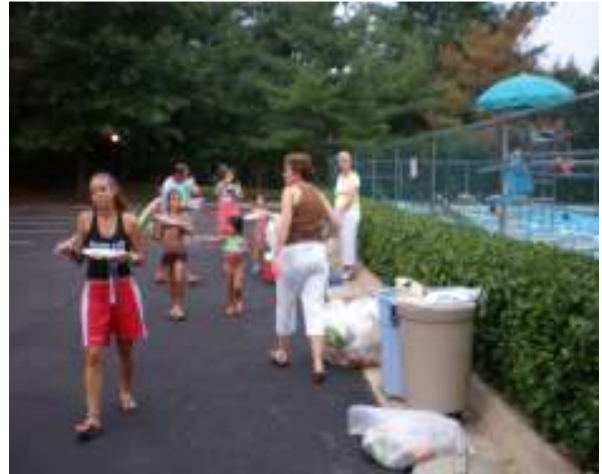
Residents enjoy the community barbecue.

The management company will be making sure that trash and toys are not being stored improperly in front of homes or in common areas for long periods of time. The bylaws are posted on the LVCA website. Both homeowners and renters are responsible for knowing and following the rules. Citations may be issued if you are not in accordance with the community guidelines. Fines will also be assessed.