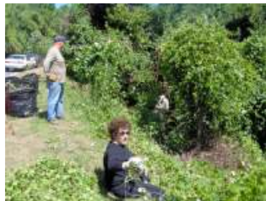
Residents work hard eliminate the invasive weeds.

The management company will be making sure that trash and toys are not being stored improperly in front of homes or in common areas for long periods of time. The bylaws are posted on the LVCA website. Both homeowners and renters are responsible for knowing and following the rules. Citations may be issued if you are not in accordance with the community guidelines. Fines will also be assessed.