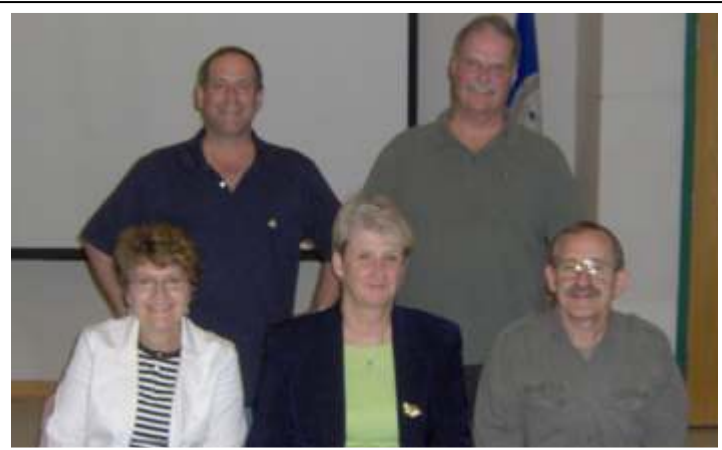
2007 LVCA Board Members (from left to right)